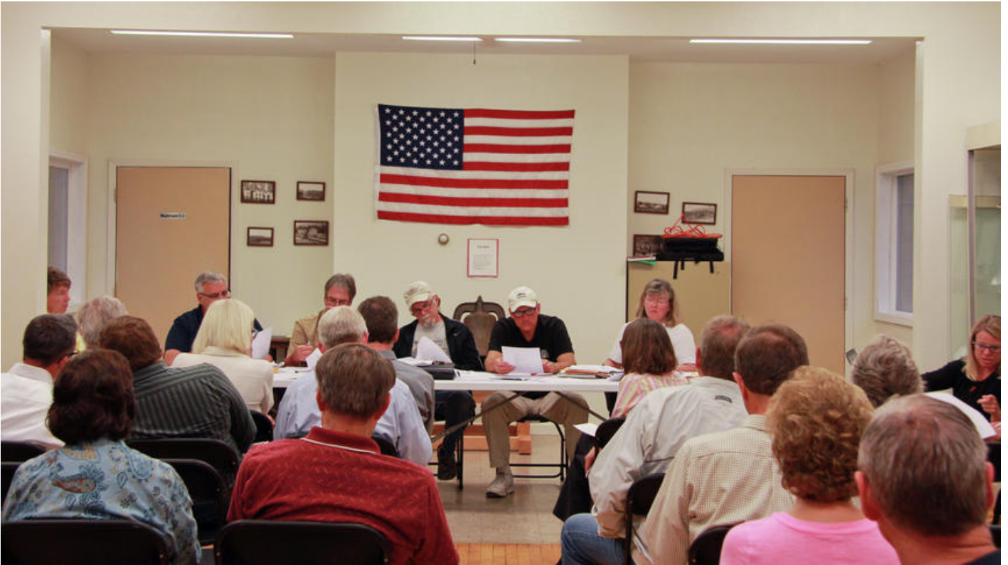
Residents listened while Wacouta Town Board members discussed the future of the Wildwood Lane Solar Garden.

WACOUTA — After much scrutiny, the Wildwood Community Solar Garden was denied a conditional-use permit by the Wacouta Town Board.